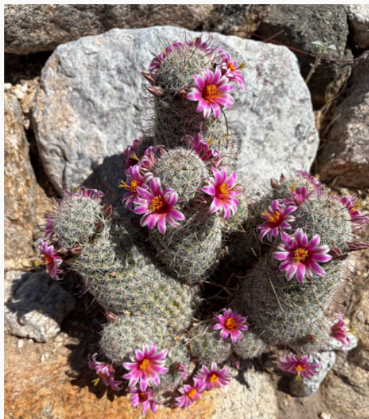
Cochemiea (Mammillaria) grahamii - flower explosion after the first monsoon rain