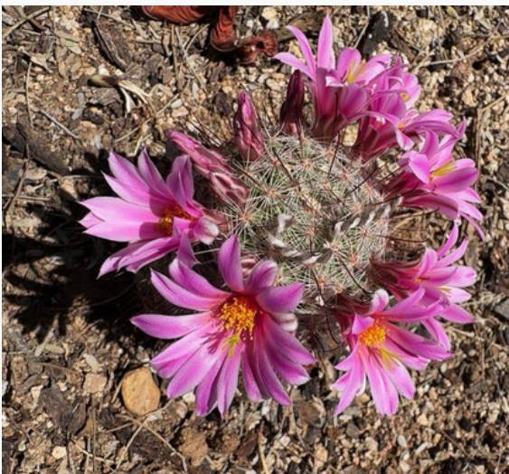
Cochemiea (Mammillaria) grahamii - I am still small but showy

CSSA AFFILIATE REP: MICHIEL PILLET (2025)