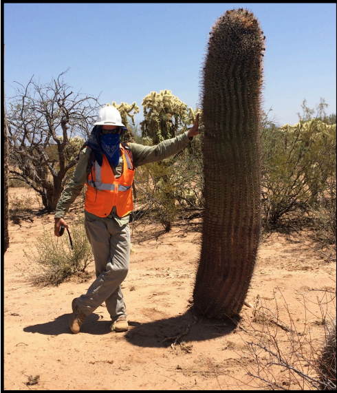
Not a saguaro, one of the larger Fercactus wislizeni that I've come across.