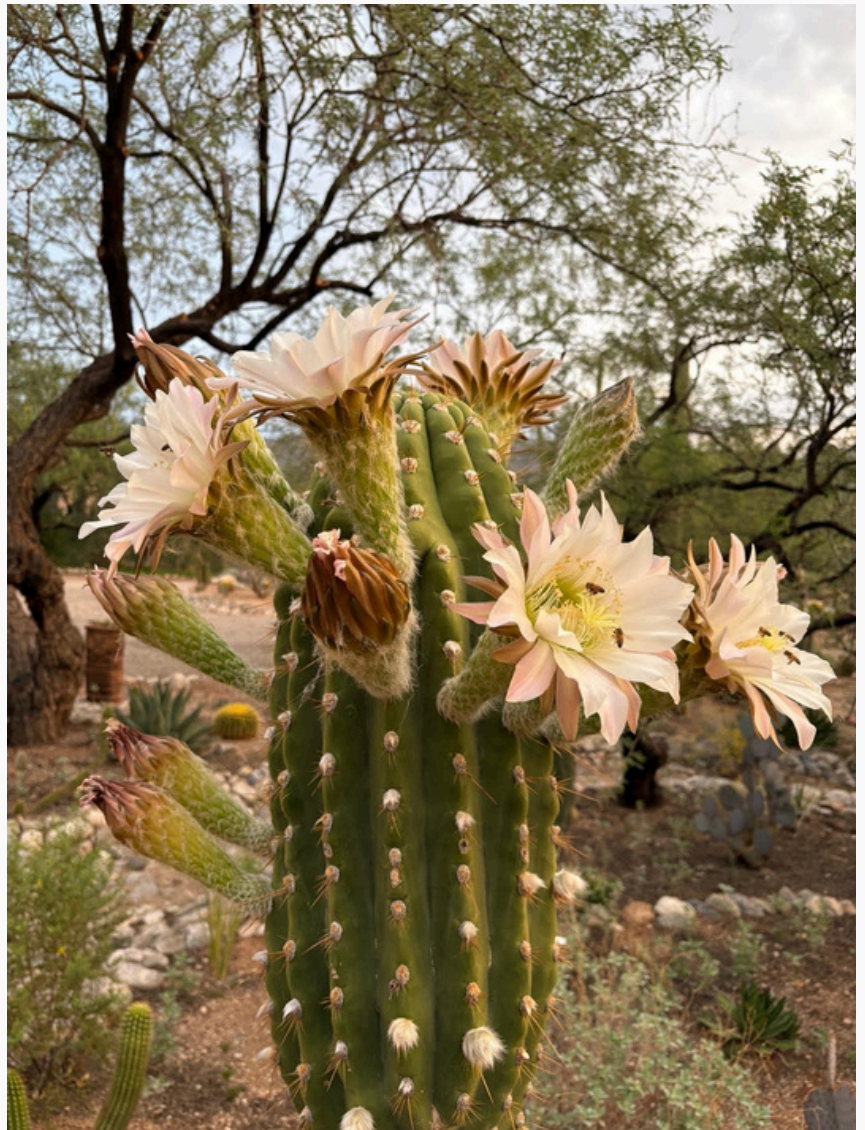
Trichocereus terscheckii - Early morning buzz